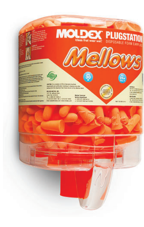
6846 Mellows PlugStation Uncorded / 250 Pairs