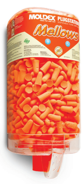
6847 Mellows PlugStation Uncorded / 500 Pairs