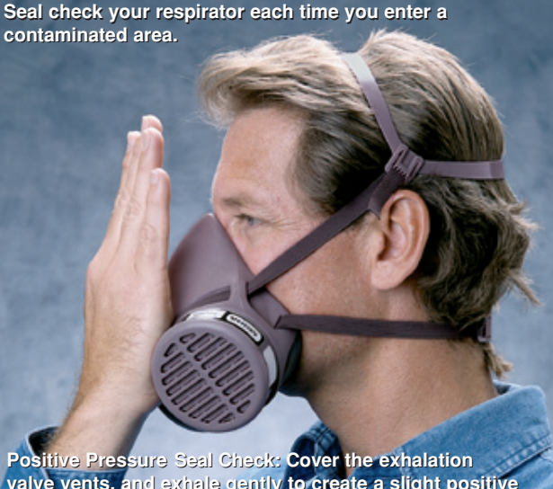
Positive Pressure Seal Check: Cover the exhalation valve vents, and exhale gently to create a slight positive pressure. If air leakage is detected, re-adjust the position of the facepiece and the tension of both headstraps, and repeat the seal check until leakage is eliminated.