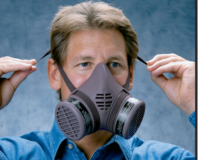
Adjust both straps to obtain a secure and comfortable fit Tighten by pulling on ends, or loosen by pushing out on