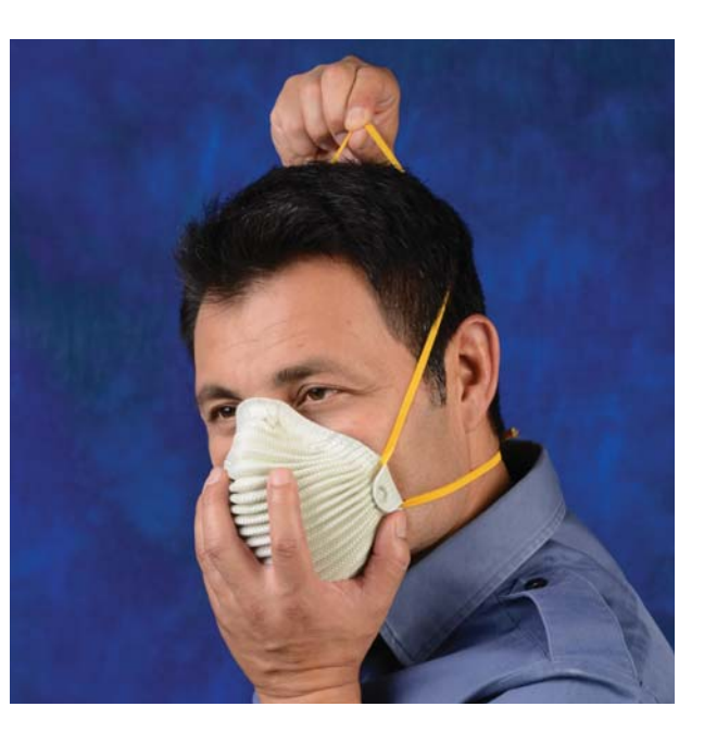
3. a) Fit mask to face and pull top of strap to crown of head. Nose cushion must not be creased inside of respirator. b) Always use both top and bottom strap.