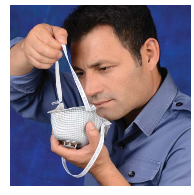
2. Place respirator under chin with molded nose contour (narrow end) up. Nose cushion must not be creased inside of respirator. Raise top strap to top back of head. Pull shorter bottom strap over head, below ears, to around neck. Do not wear with only one strap. When changing from any model/size to another respirator, you must fit test.