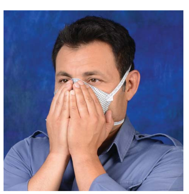
4. Each time before entering a contaminated area, perform a user seal check. Cover front of respirator by cupping both hands. INHALE SHARPLY. A negative pressure should be felt inside respirator. If any leakage is detected at respirator edges, adjust straps by pulling back along the sides and/or reposition the respirator. Repeat until sealed properly, otherwise do not enter work area and see your supervisor. Entry into a contaminated area with an improper fit may result in sickness or death.