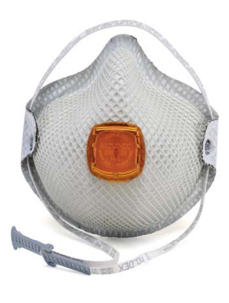
1. Attach buckle behind neck with shell against chest.