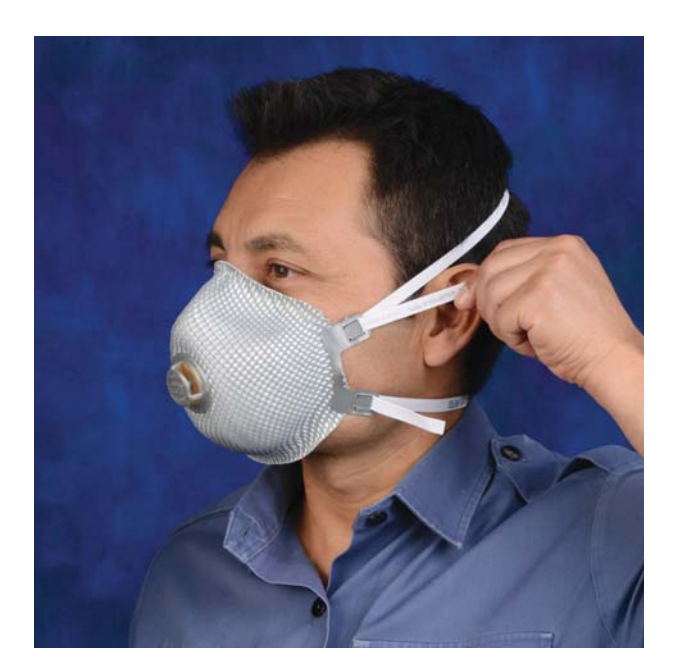
3. Adjust tension on both top and bottom straps to provide a tight and comfortable seal. To tighten, pull ends of straps. To loosen, push open hinge of buckle with thumb and pull on strap.