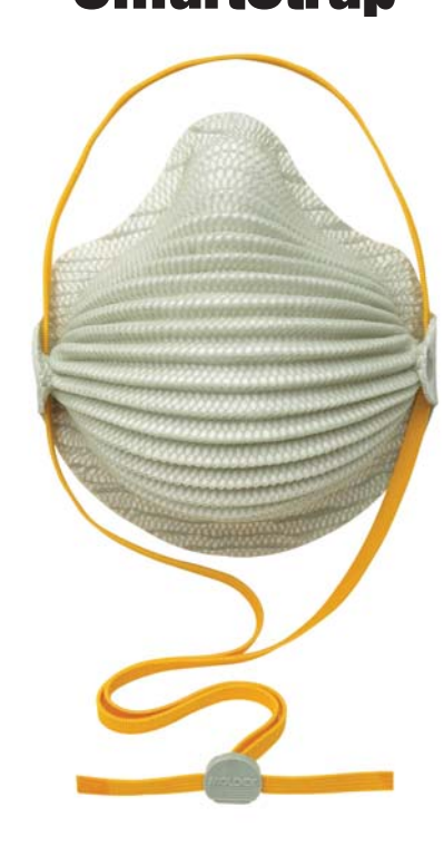
1. Pull adjustment clip and strap fully below the bottom of the mask.