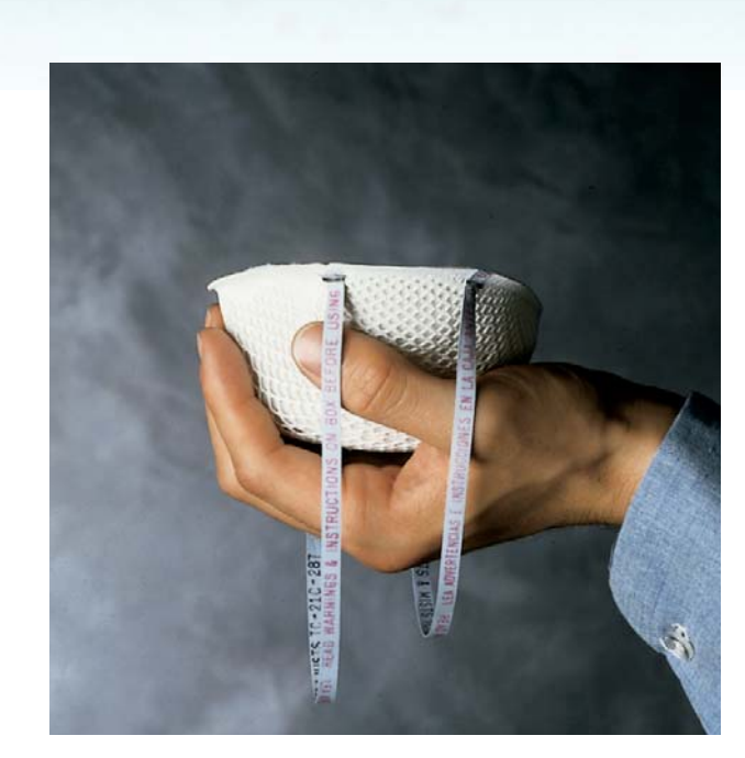
1. Hold respirator in hand with molded nose contour (narrow end) at finger tips, allowing headstraps to fall below hand.