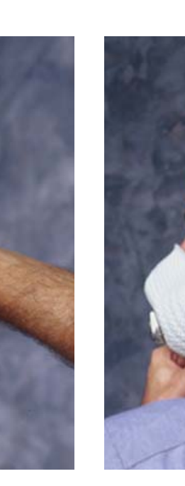
2. Place respirator under chin with molded nose contour (narrow end) up. Nose cushion must not be creased inside of respirator. Pull head harness to top of head so it rests at the crown.