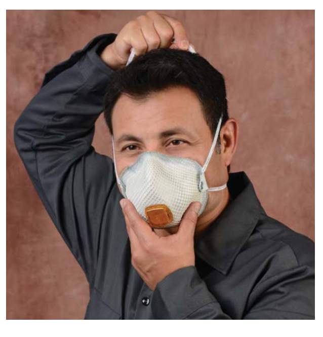
2. a) Fit mask to face and pull top of strap to crown of head. Nose cushion must not be creased inside of respirator. b) Always use top and bottom part of strap. Adjust tension for a comfortable fit. When changing from any model/size to another respirator, you must fit test.