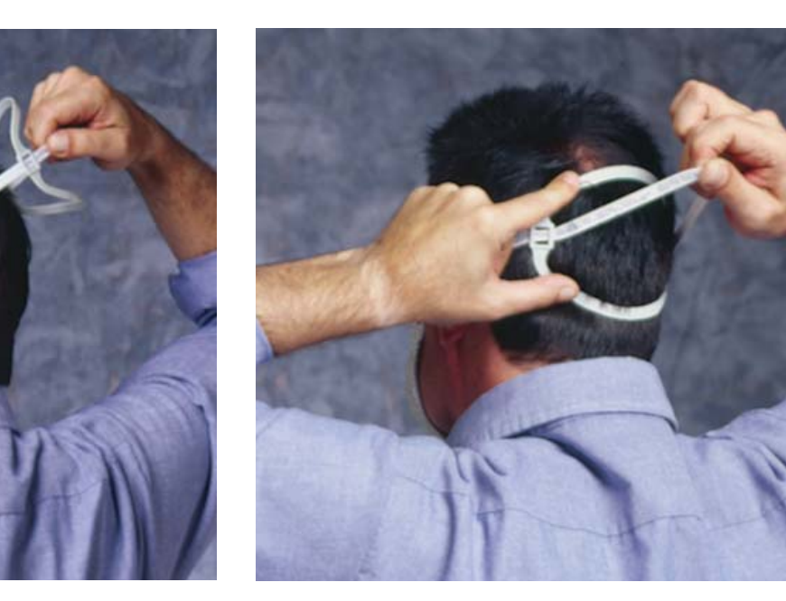
3. Adjust tension by pulling on each side of strap within the head harness to provide a tight and comfortable seal.