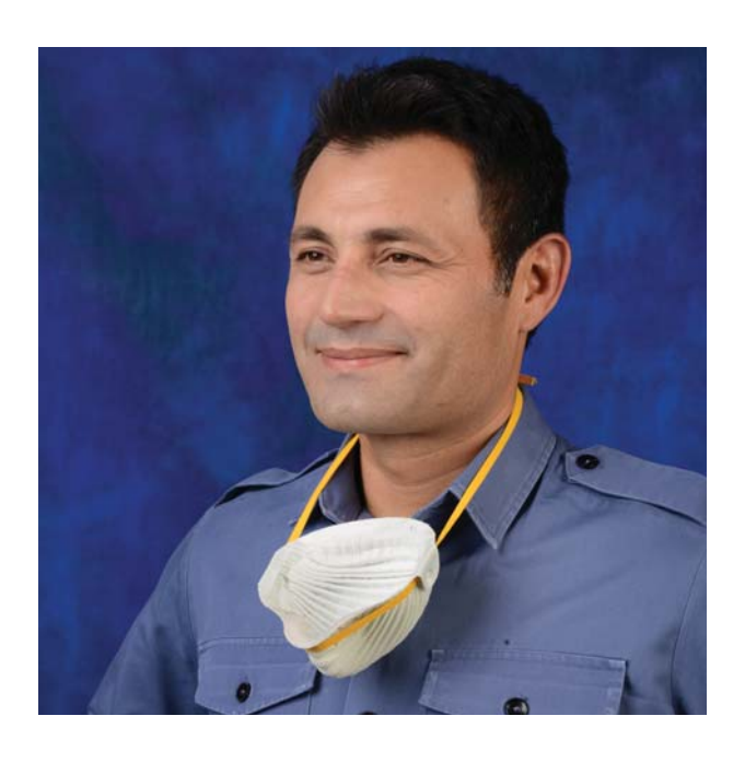
2. Place strap around neck so outside of shell is against chest.