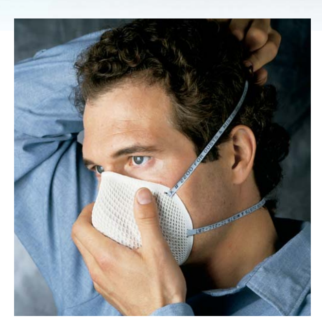
3. Adjust respirator for comfortable fit.