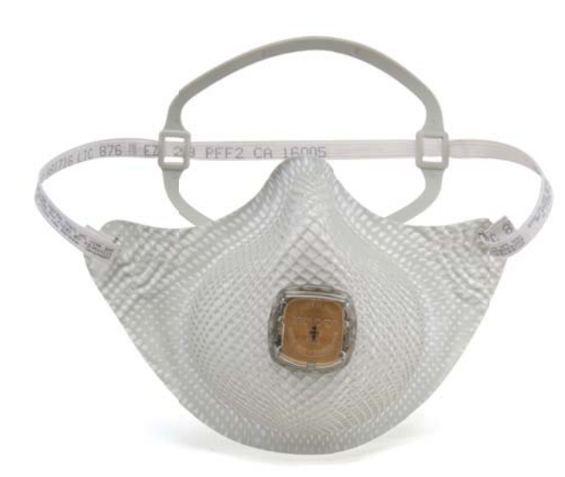
1. Hold respirator in hand with molded nose contour (narrow end) at finger tips, allowing headstraps to fall below hand.