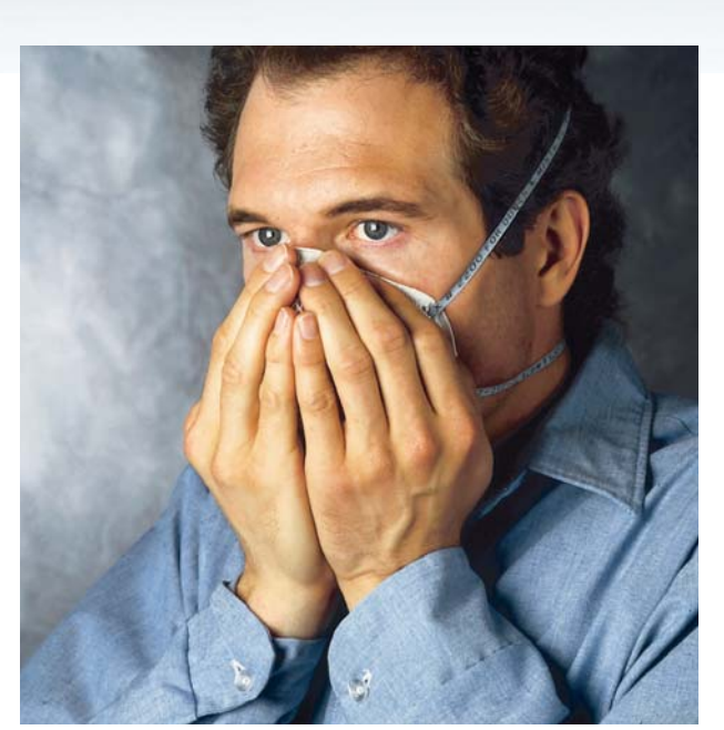
4. Each time before entering a contaminated area, perform a user seal check. Cover front of respirator by cupping both hands. INHALE SHARPLY. A negative pressure should be felt inside respirator. If any leakage is detected at respirator edges, adjust straps by pulling back along the sides and/or reposition respirator. Repeat until sealed properly, otherwise see your supervisor. Entry into a contaminated area with an improper fit may result in sickness or death.