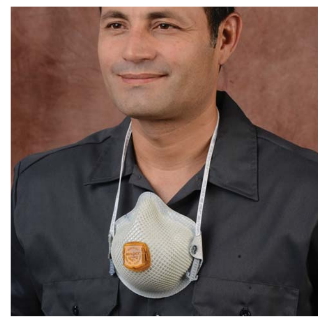
4. To hang around neck: