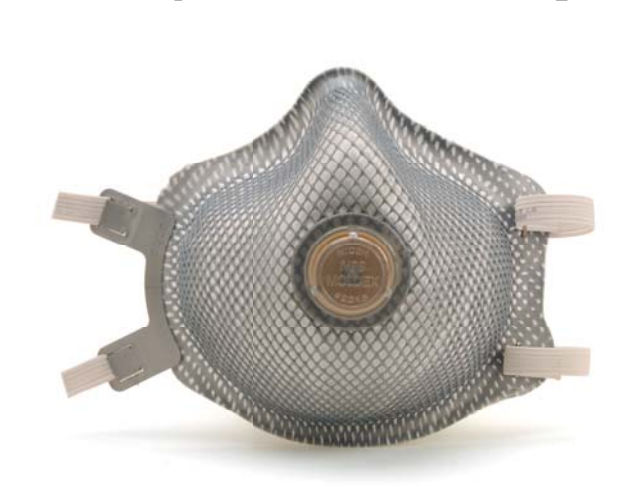
1. If necessary, untwist straps. Thread bottom strap through bottom buckle and repeat for top strap. Hold respirator in hand with nose contour (narrow end) at finger tips, allowing headstraps to fall below hand.