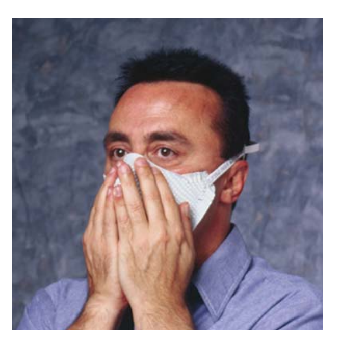
4. Each time before entering a contaminated area, perform a user seal check. Cover front of respirator by cupping both hands. INHALE SHARPLY. A negative pressure should be felt inside respirator. If any leakage is detected at respirator edges, adjust straps by pulling back along the sides and/or reposition respirator. Repeat until sealed properly, otherwise see your supervisor. Entry into a contaminated area with an improper fit may result in sickness or death.