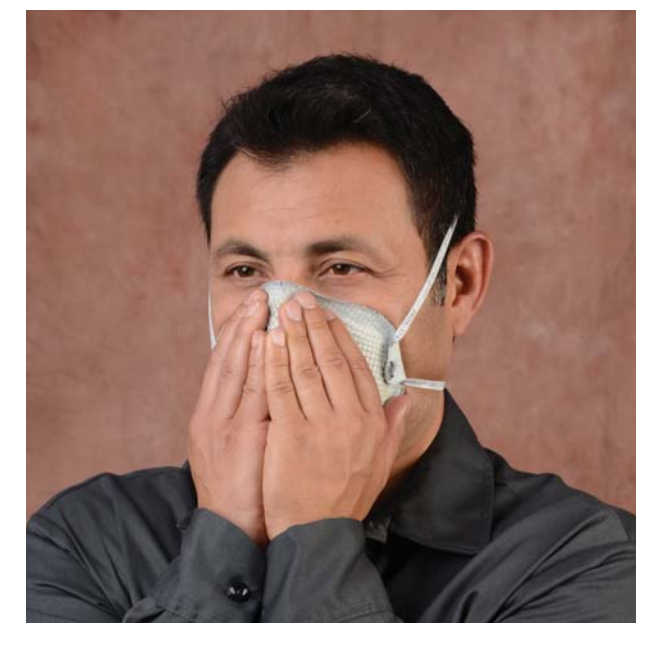
3. Each time before entering a contaminated area, perform a user seal check. Cover front of respirator by cupping both hands. INHALE SHARPLY. A negative pressure should be felt inside respirator. If any leakage is detected at OR respirator edges, adjust straps by pulling back along the sides and/or reposition respirator. Repeat until sealed properly, otherwise see your supervisor. Entry into a contaminated area with an improper fit may result in sickness or death.