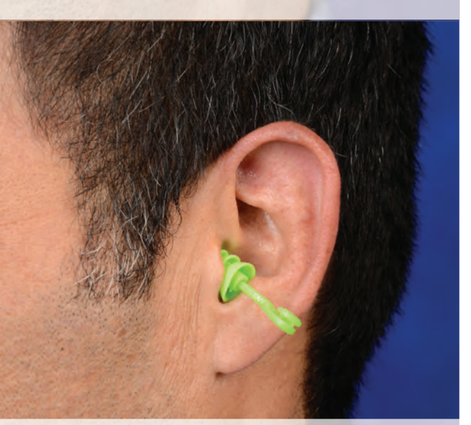
4. Correct fit.