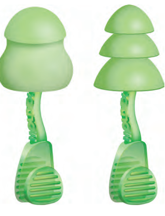
6940 & 6945 Glide Foam