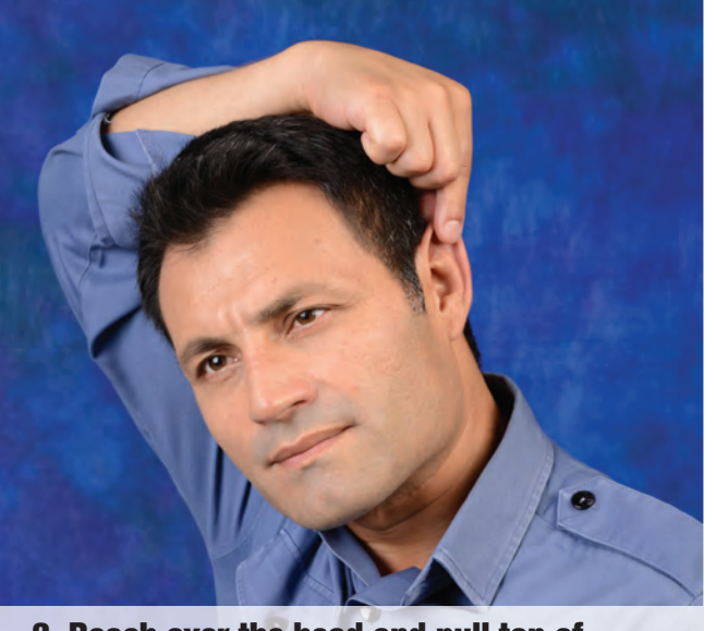
2. Reach over the head and pull top of ear upward.