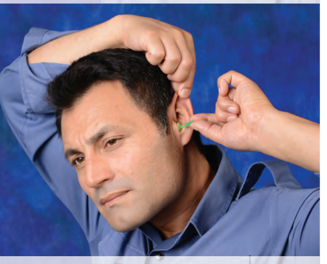
3. With other hand grasp plug handle and gently push and twist into ear canal until a tight and comfortable seal is made.