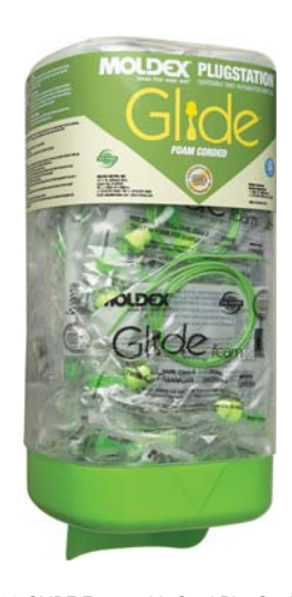
6940 GLIDE Foam without Cord 6945 GLIDE Foam with Cord