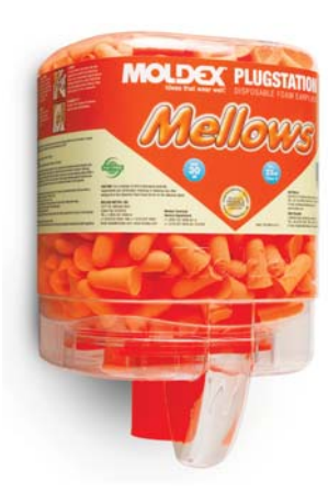
6846 Mellows PlugStation Uncorded / 250 Pairs