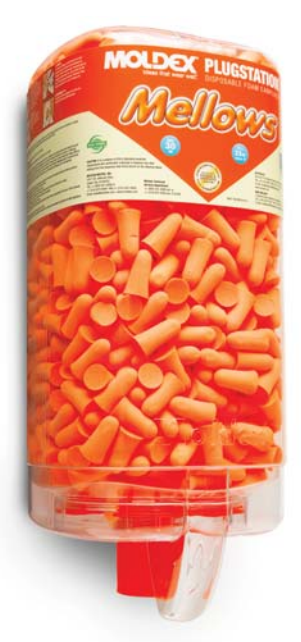
6847 Mellows PlugStation Uncorded / 500 Pairs